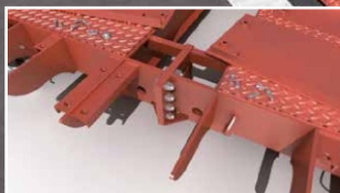
Chequer plate weighbridge deck to improve tyre traction and also prevent build up of water on the platform.