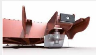
Electric surge protection device to insulate the load cell, protecting it from voltage overload, considerably reducing the risk of damage from atmospheric electrical discharges.