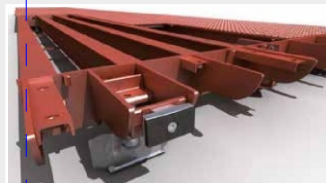
Longitudinal hatch supporting structure specially sized to optimise deck strength and system accuracy, even in harsh operating conditions. Sandblasting and subsequent painting of all the metallic parts to protect against oxidation. Special wax coating applied to all underside surfaces for optimum protection.