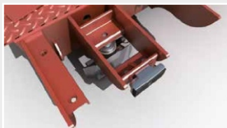
Double front edge complete with impact resistant buffers - extremely important to prevent deterioration of concrete in areas of contact while a vehicle is braking.